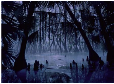
The “swamp” in darkness

Then immediately Zedekiah ran up to Micaiah and slapped him in the face: "Which way did the spirit of the Lord go when he went from me to speak to you?" he asked. Micaiah responded back by saying: "You will find out on the day you go and hide in an inner room." [1 Kings 22:13-28]